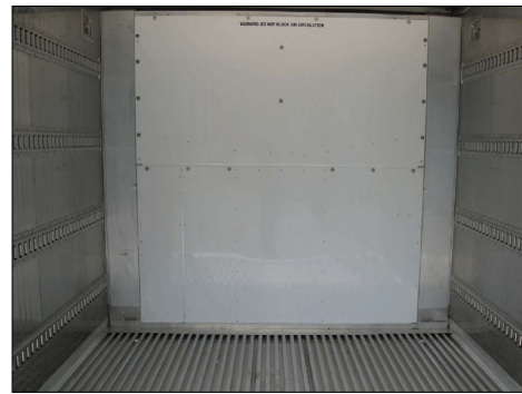
Stainless steel interior lining