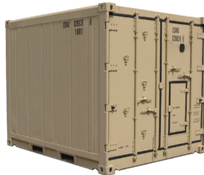
Double swing doors with escape hatch