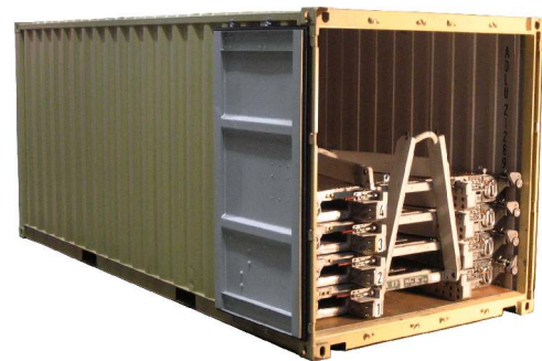
J-MIPs stacked 4-high and secured in an ISO container