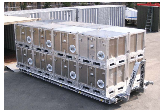
(16) J-MICs be can locked on a J-MIP