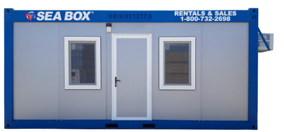
Pictured: SB3645.9 LBMO-2, standard 2 window, 1 door setup