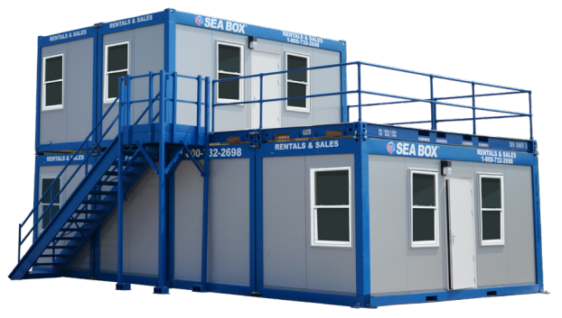
Pictured: 2 level custom MOBU complex. shown with 4 window, 1 door setup