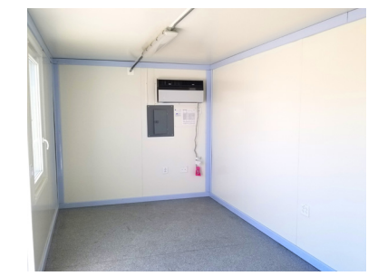
Pictured: Interior Office Space